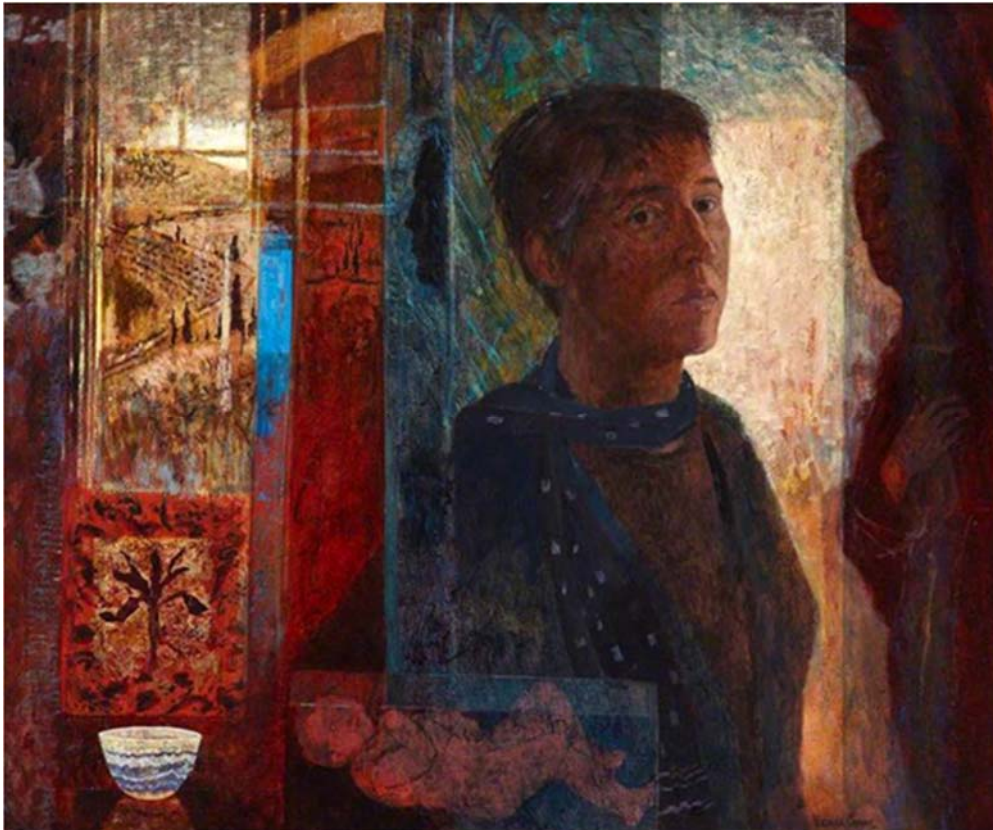
Image caption: Victoria Crowe, Italian Reflections, City of Edinburgh Museums and Galleries

This year’s summer exhibition at the City Art Centre has now closed. It has been a fantastic success, garnering five-star reviews from the press and being hailed by many visitors as one of the standout exhibitions of 2019. The display comprised of over 150 loans from 77 public and private collections throughout the UK and America. During the run almost 40,000 visitors came to the gallery, museums staff delivered 105 public events ranging from lectures and guided tours to creative writing workshops and a fashion show, and coordinated a schools programme that included 33 full day workshops for Edinburgh Primary Schools. Over 1400 catalogues were sold together with thousands of postcards and other retail goods, and well over a thousand comments have been left in our visitors book (with one guest recording they had visited 11 times!). The exhibition had been over two years in the planning, and would not have happened without the tremendous support of the artist herself, her husband Mike, and staff at the Scottish Gallery.